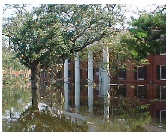
Carey Hall, the women's dormitory at NOBTS, sustained extensive flooding on the first floor.

Administrators, faculty, and friends of ATS member schools are invited to attend the ATS reception at the AAR/SBL annual meetings in Philadelphia, PA. Please plan to join your colleagues and friends for refreshments and conversation.